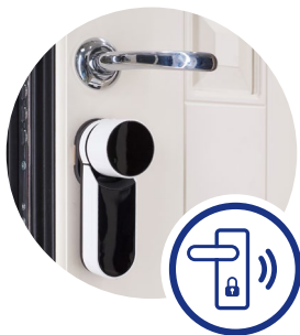
Smart door locks